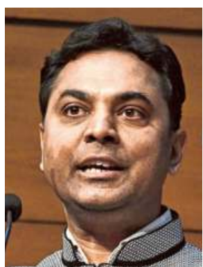
Krishnamurthy Subramanian, Chief Economic Adviser

OUR BUREAU New Delhi, October 30 India Inc should now respond to the several ethical wealth creation opportunities thrown open by the recent reforms (such as those in labour laws) undertaken by the Government, said the Chief Economic Advisor to Finance Ministry Krishnamurthy Subramanian.